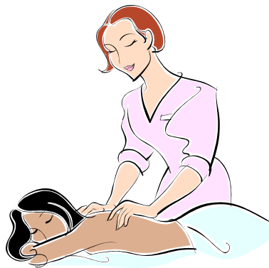
60-minute massage... $60

Drop a few blackberries in the bottom of a salad bowl and lightly mash with a fork to release the juices. Scatter in some sliced endive. Stir in ripe, chopped avocado. Grate in some Pecorino cheese (an aged sheep's milk cheese and a switch from your usual Parmesan). Add a bit of orange zest. Drizzle in a high quality extra virgin olive oil and good balsamic vinegar. Season with sea salt and freshly ground pepper, toss, and you have a salad that will wake up your palate with fresh summer flavors.